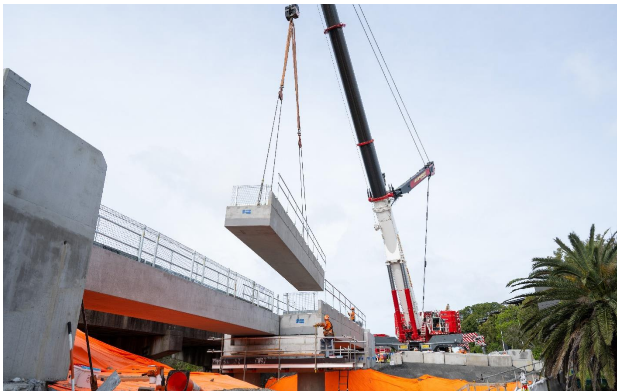
A girder being lifted into place at Mill Stream bridge