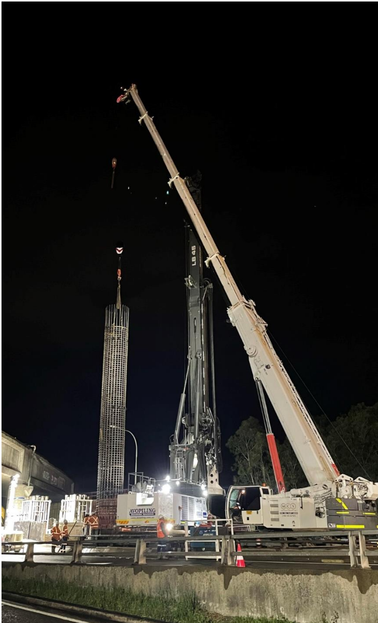
Work on the new centre pier for Southern Cross Drive bridge