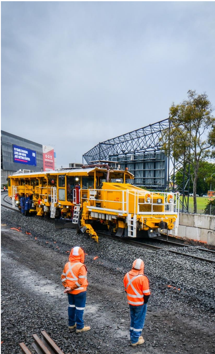
Recent rail shutdown work between General Holmes Drive and O’Riordan Street bridge