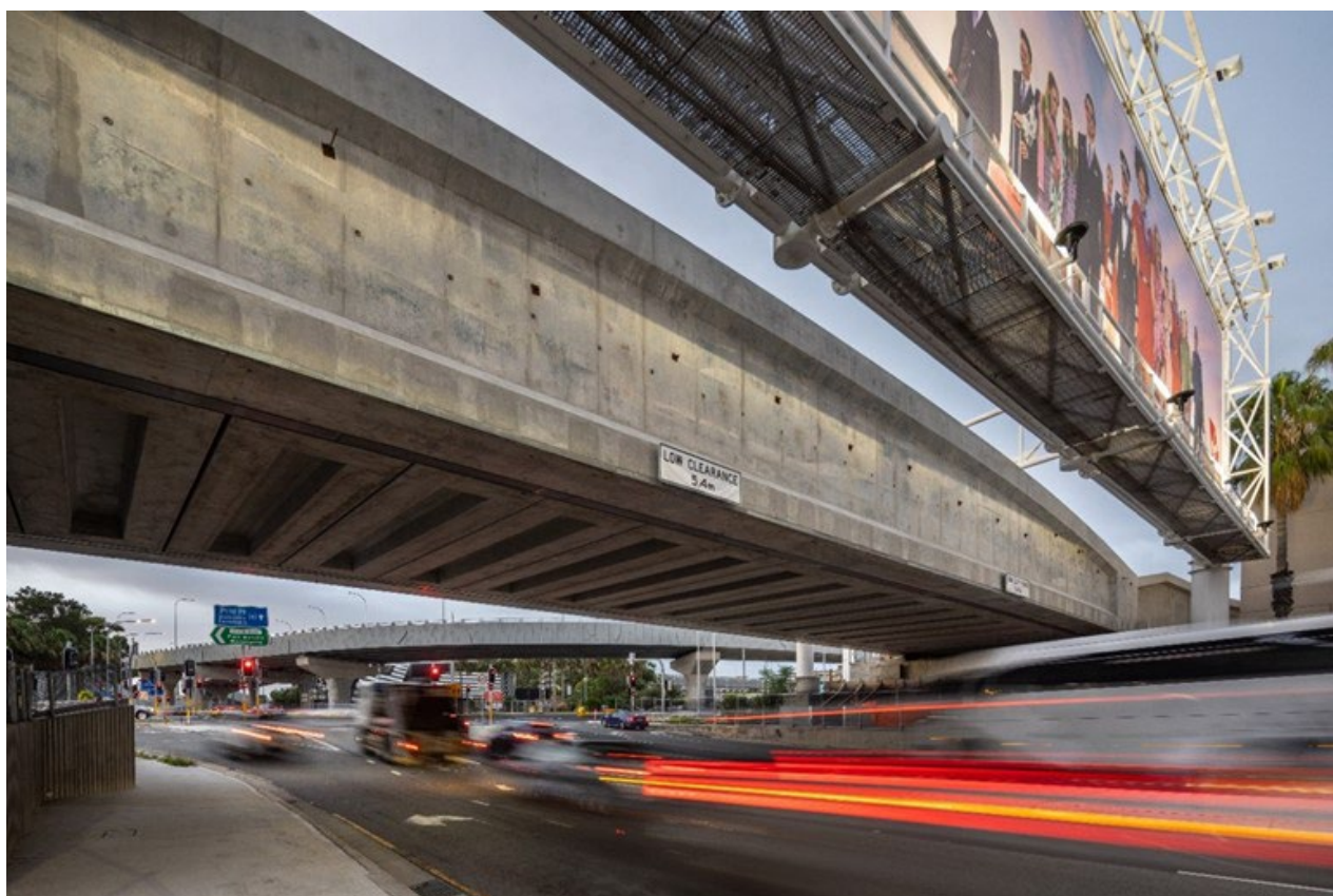
The new O’Riordan Street bridge, following completion of major construction