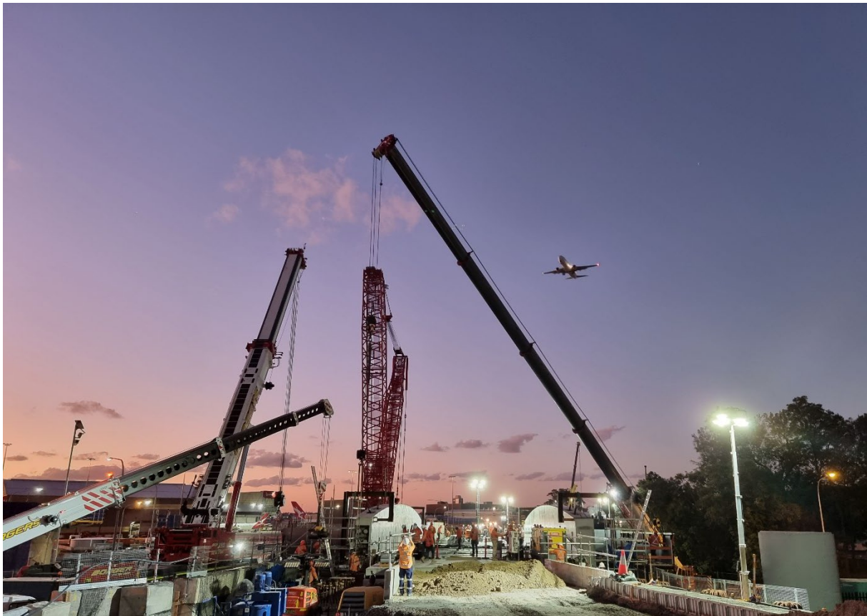
Building the new bridge at Robey Street, February 2023