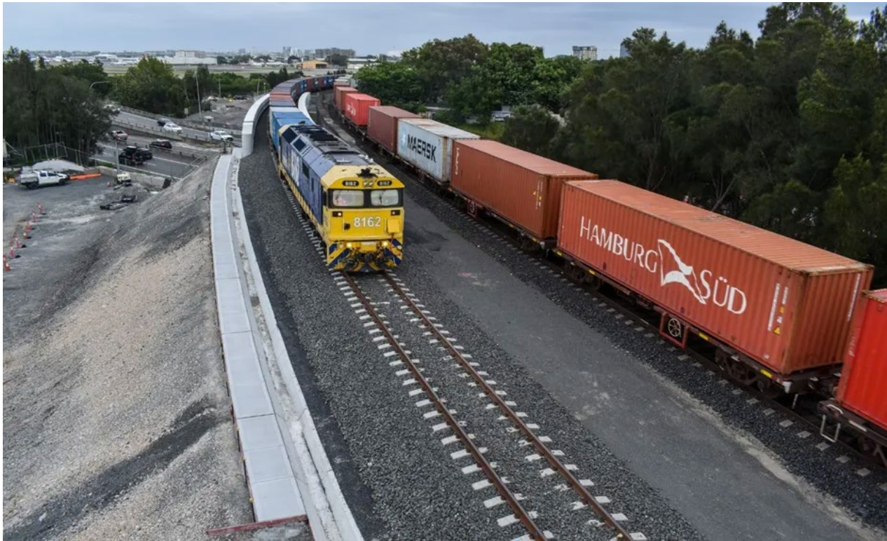
The first freight trains passing over the newly-commissioned track at Southern Cross Drive

To provide feedback about the project: please call our 24-hour Enviroline on 1300 550 402, email botanyduplication@jhg.com.au , or mail John Holland, Level 3, 65 Pirrama Road, Pyrmont, NSW, 2009 and mention 'March project newsletter'