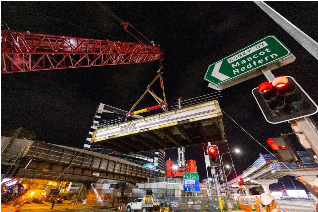
Removing the old Robey Street bridge, February 2023