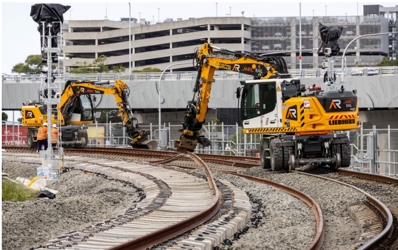
Lifting and aligning the new rail track near Robey Street bridge, also in January 2024