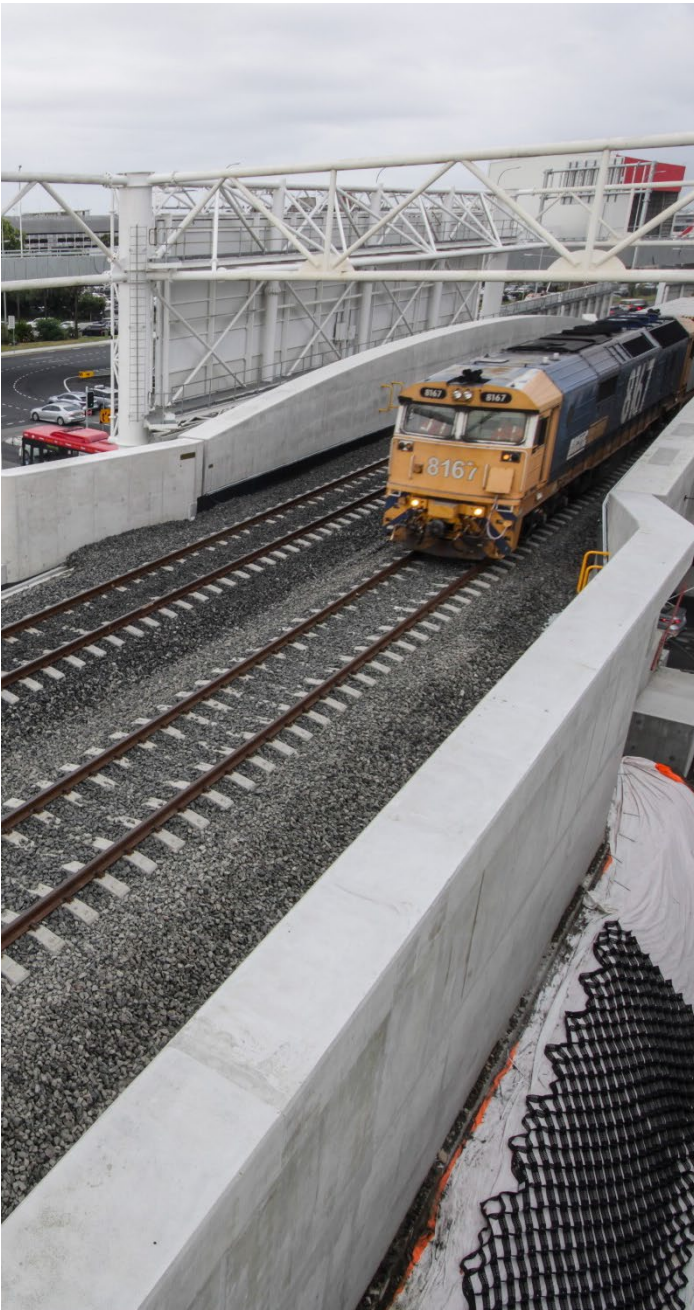
The first train uses the newly-commissioned track over O’Riordan Street bridge at Mascot

Take a look through this newsletter to see some images of major construction milestones throughout the project.