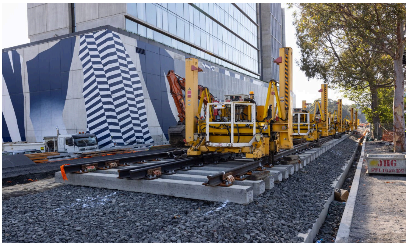
Installing new track and rail turnouts near Baxter Road, Mascot, during weekend works in January 2024