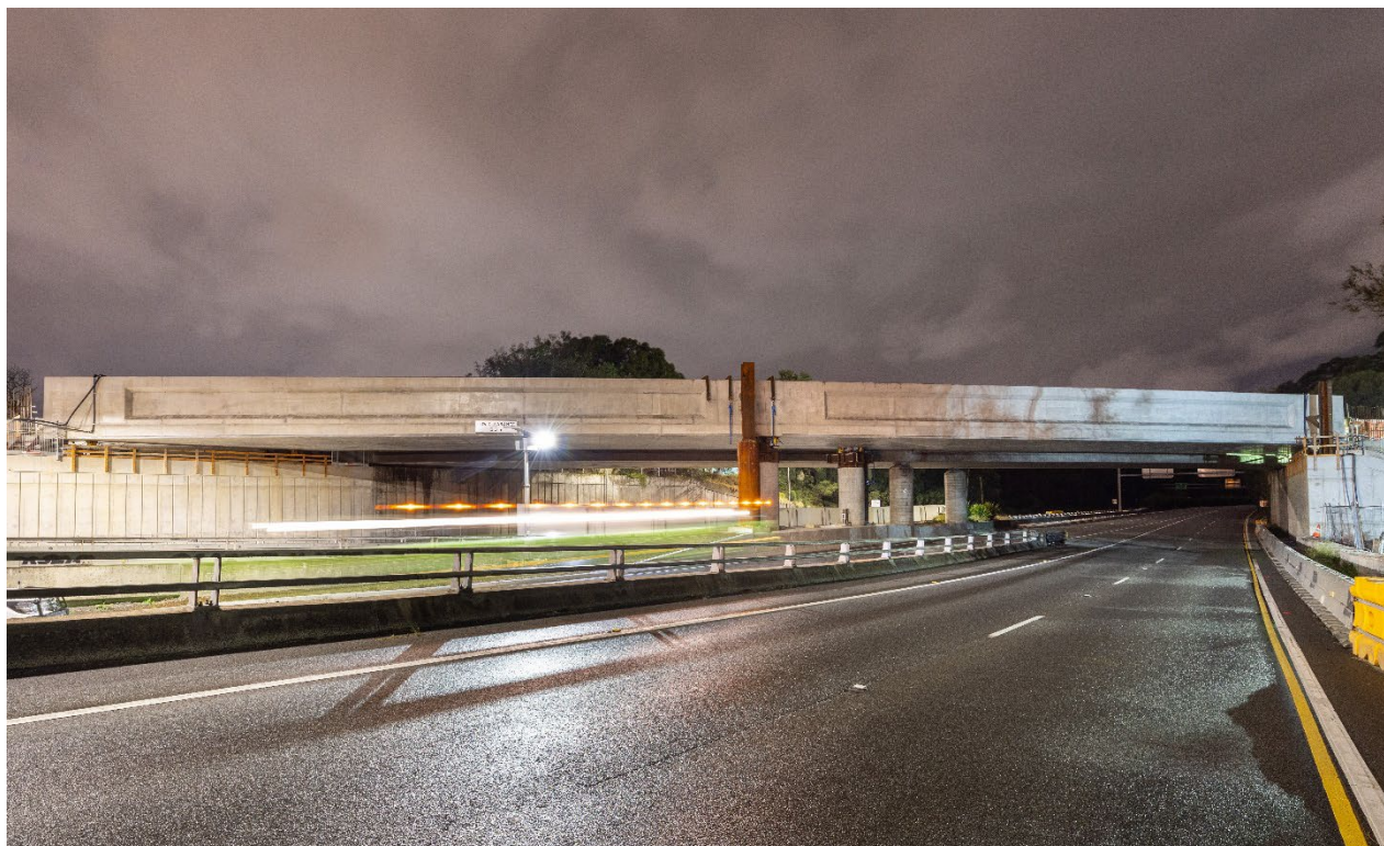
The structure of the new Southern Cross Drive bridge was completed in late 2023