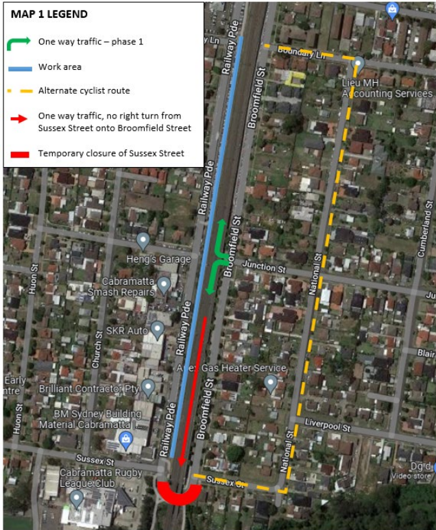
Map 1: Phase 1 Broomfield Street (Junction Street) Map 2: Phase 2 Broomfield Street (Boundary Lane)