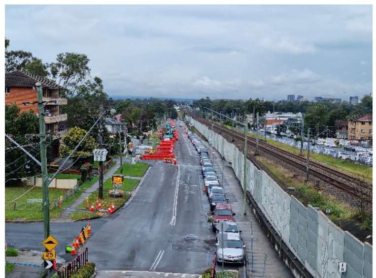
Broomfield Street view from Cabramatta Station, Cabramatta

We are now starting work on the western side of Broomfield Street, which will include stormwater drainage installation, construction of the retaining wall and finally, the relocation of the noise wall.