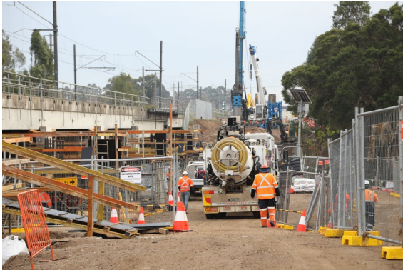
Piling and form work activities at the Sussex Street bridge

There has been a great deal of construction near the Cabramatta Creek as we make steady progress with piling and formwork (to prepare for pouring concrete) as part of the construction work for the new Cabramatta Creek and Sussex Street rail bridges. Despite heavy rainfall and flooding at the beginning of July, the team quickly rebuilt the piling pads, cleaned up the debris and returned to work within a few days. Fortunately, there was no permanent damage to the site or equipment.