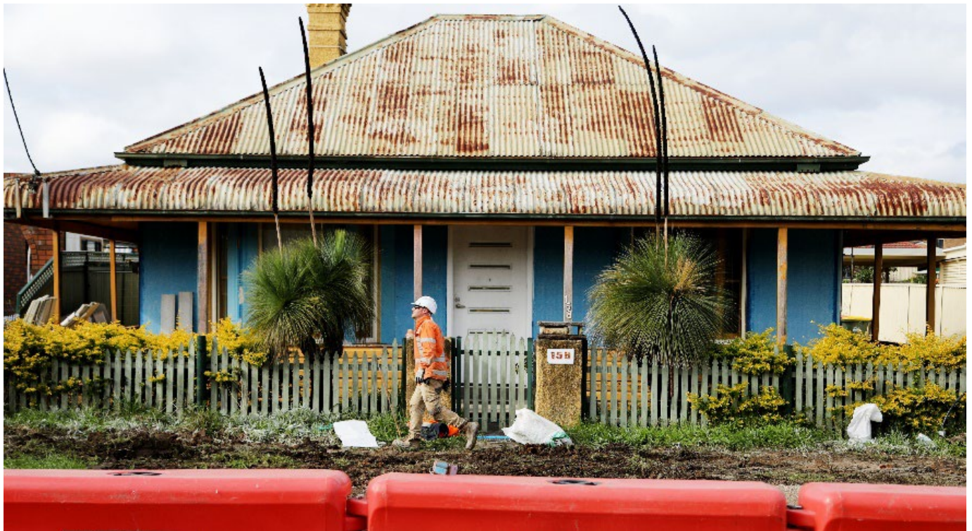
Construction is well underway on Broomfield Street, Cabramatta

News from the Cabramatta Loop Project September 2022