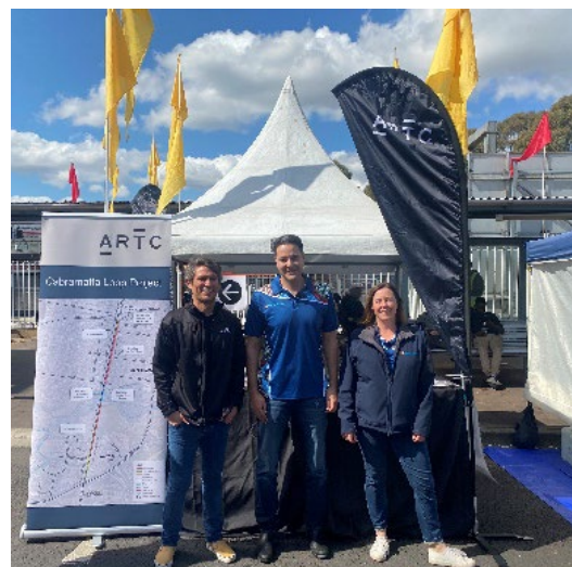
Our team at the Cabramatta Moon Festival stall

We held a similar session at the Cabramatta Rugby League Club in June. It was a successful evening and great way to engage with local residents.