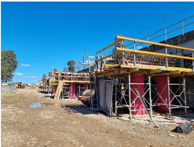
Cabramatta Creek bridge form work

Due to the frequent wet weather we are experiencing, the project area is subject to flooding and the timing of these works may change. Please contact the project team if you have any questions or concerns. We appreciate your continued patience and understanding while we carry out this important work.