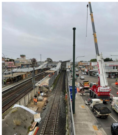
Work at Cabramatta Station

We carried out construction activities including signalling work, bridge piling, concrete pouring and using cranes for lifting plant and material into the rail corridor at various locations on the rail network in the area.