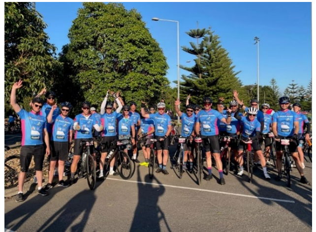
Cab Loop team members after the MS Gong Classic ride.

This year 10,000 cyclists took part in the ride, which winds its way from Sydney to Wollongong. Our team took on the 79km course challenge and raised almost $53,000 for this worthy cause to contribute to the search for a cure.