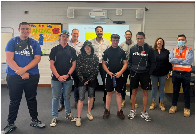
The Year 10 students and members of the Cab Loop team.