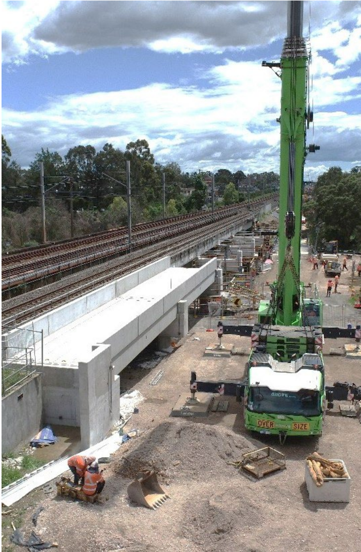
The new rail bridge at Cabramatta Creek is taking shape.

This issue reflects on the progress over the last year and what you can expect to see in 2023, as we begin to shift focus to work inside the rail corridor. If there's something you want to hear about, please let us know.