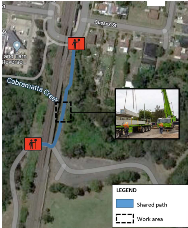
Shared path map