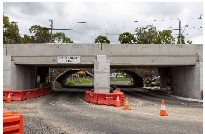
The Sussex Street underpass will temporarily close for five weeks.