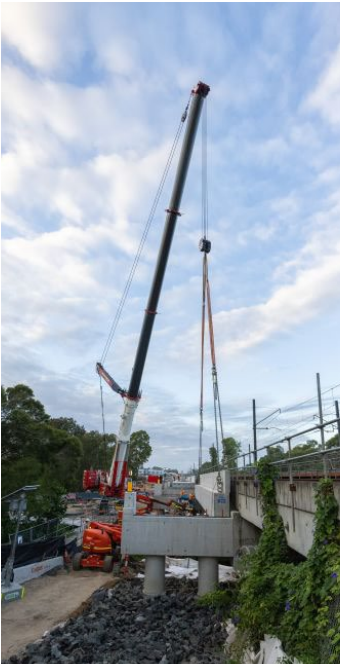
The final planks have been installed on the Cabramatta Creek rail bridge.

This issue looks at the completion of a major phase in construction of the two new rail bridges over Cabramatta Creek and Sussex Street, a temporary road closure and upcoming works in the rail corridor and on Broomfield Street. If there's something you want to hear about, please let us know.