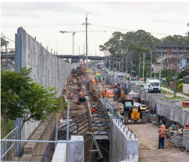
The Broomfield Street noise wall is moving soon.

Due to the staged nature of this work, there will be a period of time when sections of the noise wall will be left open to the rail corridor. During this time, we will install noise blankets to reduce the impacts of rail traffic on nearby residents.